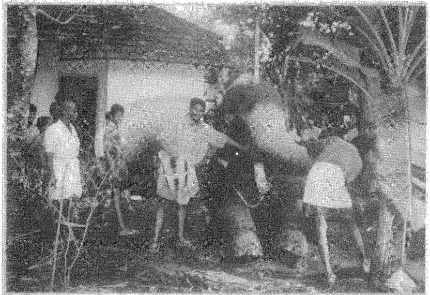
Mahout trainees learn the correct techniques in giving an elephant a bath.

a) Persons who had been working as mahouts in various establishments like Forest Department, Zoos, etc.